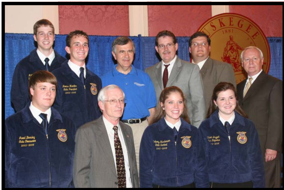
U.S. Secretary of Agriculture, Mike Johanns, poses for picture with Alabama Agriculture Commissioner, State FFA Officers, and State Staff at the Farm Bill Forum held at Tuskegee University

While thinking about this, it occurred to me that we, as teenagers, are the next generation these responsibilities will fall to in future times of need. As FFA members