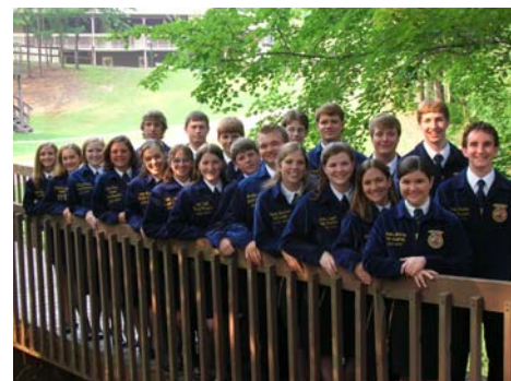
Alabama’s State and District Officers at the District Officers’ Leadership Conference (DOLC) held in Columbiana, Alabama.

simply a matter of thinking big, being creative and not being afraid to take a risk!!