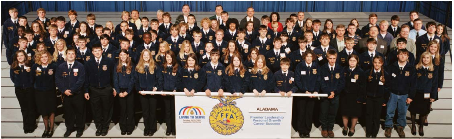
Pictured above are the members and advisors of the Alabama FFA Association that could make the scheduled time for Alabama’s State Photograph at the 2005 National FFA Convention in Louisville, Kentucky. Alabama had over 500 students, advisors and supporters registered for the National Convention. Make it your chapter’s goal to be included in this photograph at the 2006 National FFA Convention in Indianapolis, Indiana.

Wow, the 78th National FFA Convention was a great year to end our seven-year run in Louisville! Our trip was filled with almost sleepless nights, wishing we had